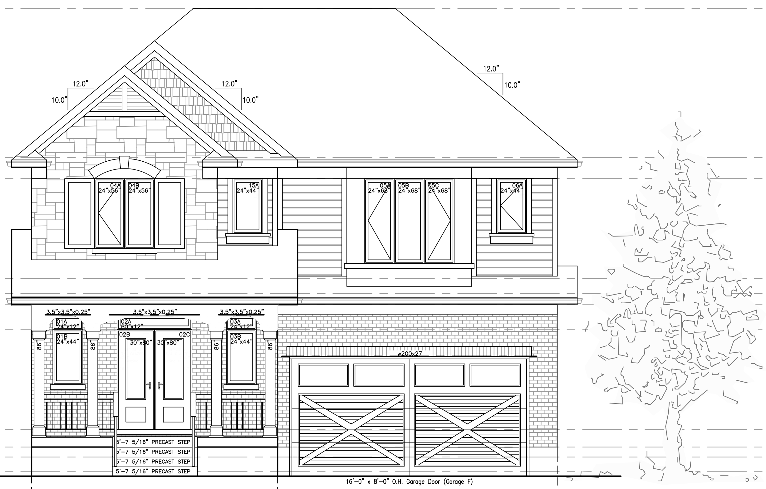
Front Elevation SCALE 1/4" = 1'-0"

SB12 HEEL HEIGHT CHECK Overhang 16" Pitch 23.97 Wall 8'-1" Soffit drop 8.00" STAIR CALCULATION 15 Risers @ 0'-7" 5/8" each For a total run of 121.00" STAIR CALCULATION 15 Risers @ 0'-7" each For a total run of 105.00"